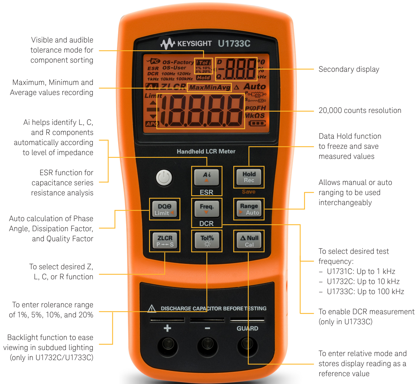
Figure 2. Front view of the U1733C