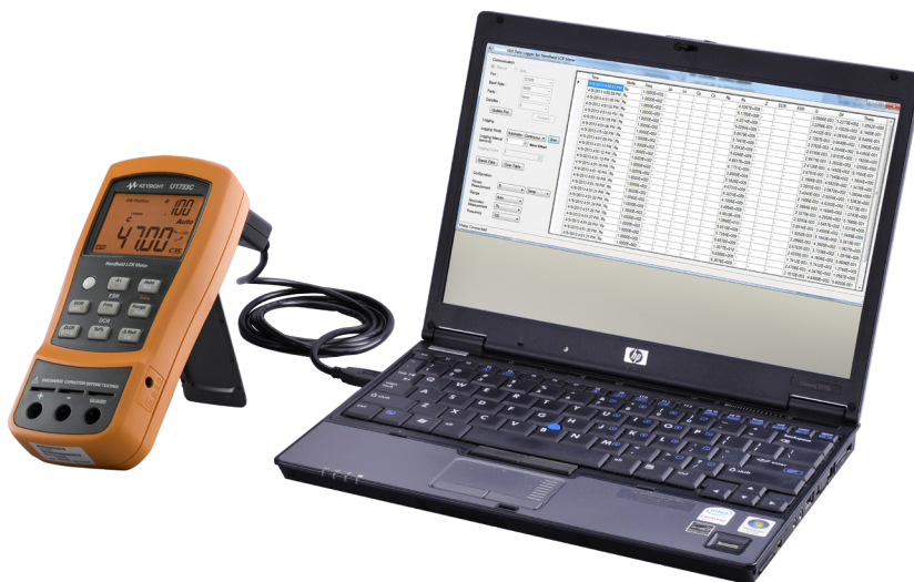
Figure 1. Automate the recording of continuous readings when you hook the U1731C/U1732C/U1733C to a PC

The handheld LCR meters allows you to test various component types, including secondary components of Dissipation Factor (D), Quality Factor (Q), and Angle Indication of Impedance ( \theta ). This new handheld series also includes other functions that result in a more detailed component analysis. For example, the built-in Equivalent Series Resistance (ESR) function helps you better understand the inherent resistance behavior typically found in capacitors across selected frequencies. DCR is a built-in DC resistance measurement that eliminates the use of a separate digital multimeter (DMM) for component test.