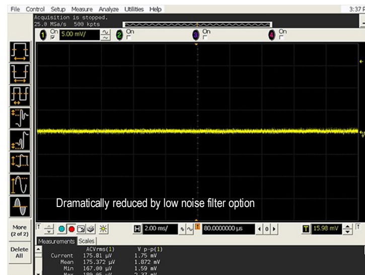
Captured by oscilloscope