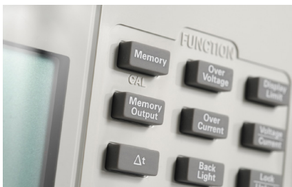
Figure 1. Output sequencing made easy with intuitive keypads

Both models of the U8030 series come with a set of features to suit your needs while remaining easy to use. The LCD screen displays both voltage and current readings in a one-view panel while the all ON/OFF button allows multiple outputs to be controlled simultaneously. Additionally, the auto-track feature simplifies setup between output 1 and output 2. With these, you get a solid bench power supply plus a set of convenient and easy to use features.