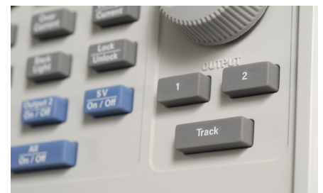
Figure 3. Simplifies Output 1 and Output 2 setup with tracking feature